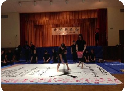
Gardena Buddhist Church Japanese Language School - Purchased Japanese calligraphy materials