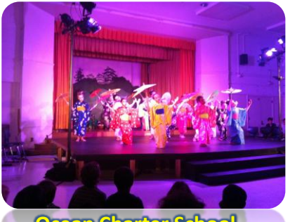
Ocean Charter School - Lighting system for school play