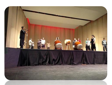
Long Beach Polytechnic High School - Taiko Concert & workshop

See "2017 JEG Program Guide" for detail or visit http://www.jba.org/2017-japan-enrichment-grant/