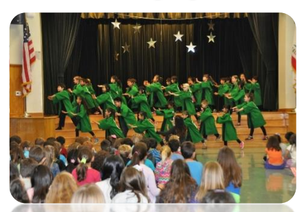
Dunsmore Elementary School - Purchased Happi Coats